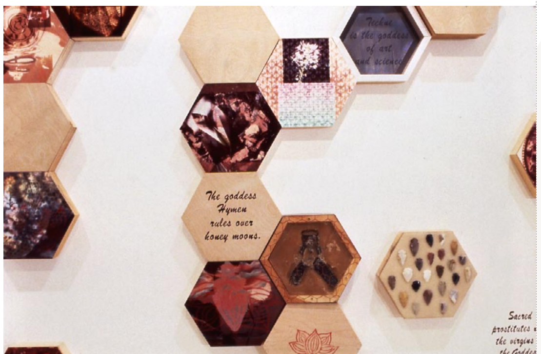
The Honeycomb Wall, 1993–94 (detail) Cat. no. 1